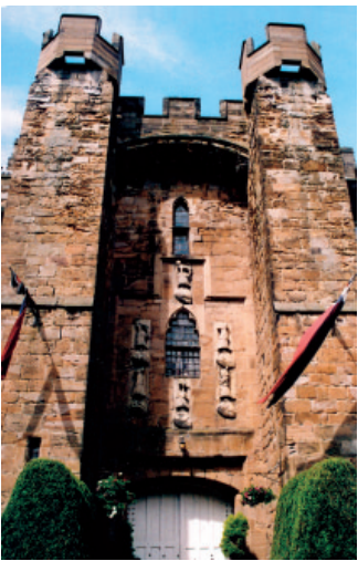
The gatehouse at Lumley Castle