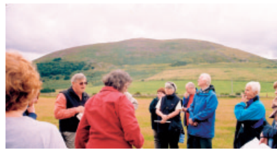
Visiting Ad Gefrin