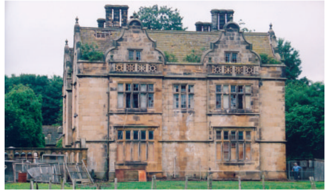
Sockburn Hall in June. The vegetation on the roof has since been attacked with the aid of a cherry picker