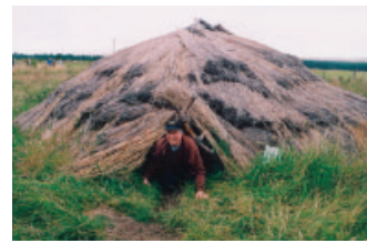
The Mesolithic hut at Maelmin