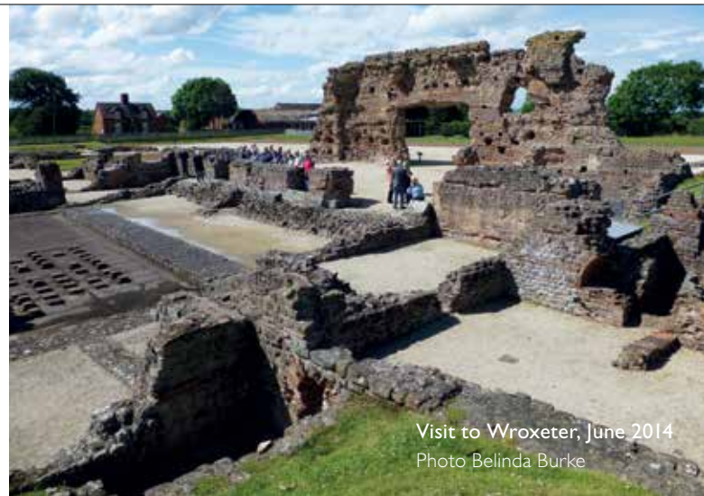
Visit to Wroxeter, June 2014