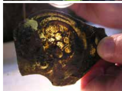
▲ Norman Emery examines a fragment of medieval glass ♦ The glass fragment

the earlier appearance of the area. It will also allow further areas of the Covey to be investigated. The removal of wall plaster and 1951 brickwork is revealing built features, and methods of construction, which may help in elucidating the structural history of the kitchen and its associated buildings.