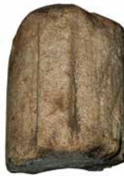
A fragment of an early 14th-century moulded stone window mullion Scale 1:2 © Erik Matthews

Further information has also been uncovered in respect of the usage of the building, with significant further quantities of expensive imported pottery from the 14th and 15th centuries, and bones of wild boar and venison representing elite dining. Other artefacts have also been uncovered which provide an interesting insight into daily life including the hinge from a large timber chest, a bronze jetton and the handle from a simple iron lamp. Quantities of an orange/red waxy substance sealed between the collapsed medieval walling and floor have also been found which will shortly be analysed by the Bio-archaeology Unit at York University.