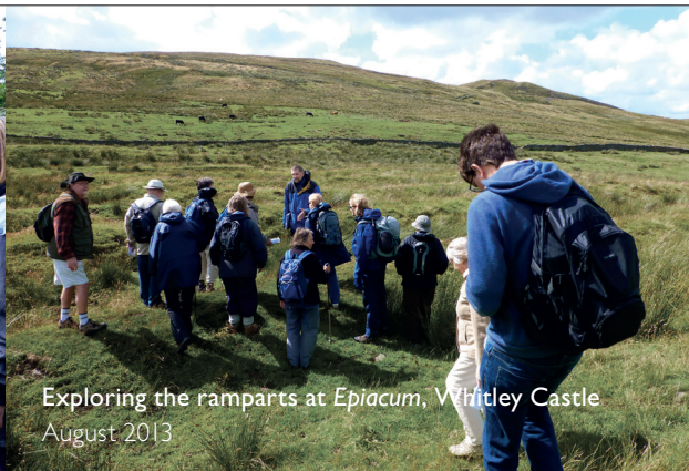
Exploring the ramparts at Epicum , Whitley Castle August 2013