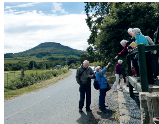
In search of Trimontium , Newstead Roman fort. The Eildon Hills, with the Bronze Age hill fort, are in the background June 2013