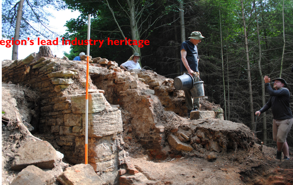
Volunteers excavating the chimney bases and condensing chambers at Dukesfield in summer 2013, under the direction of The Archaeological Practice Ltd