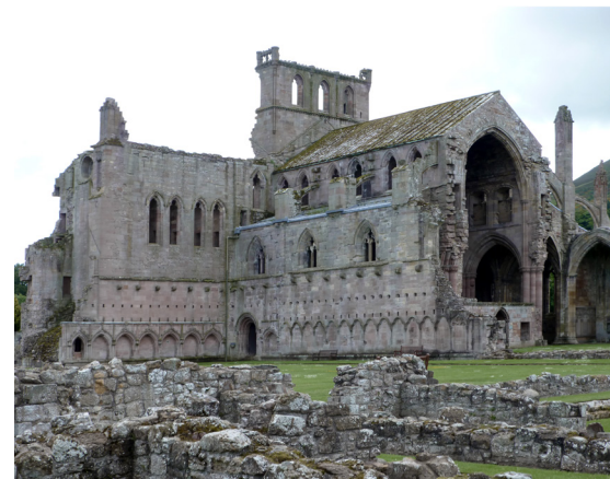
Excursion to Melrose Abbey June 2013

Architectural and Archaeological Society of Durham and Northumberland