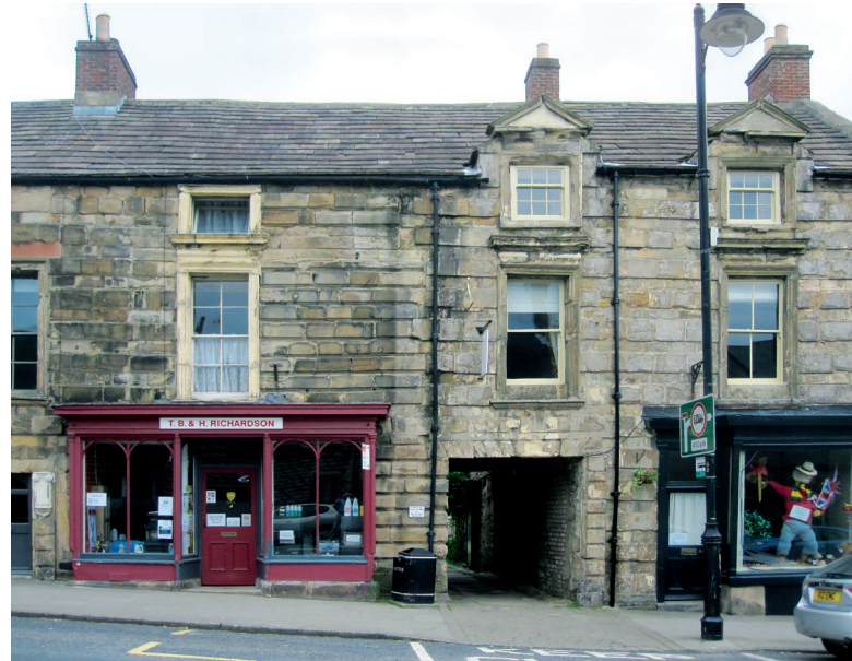
The 17th-century facade of the enigmatically named 'Manor House' on The Bank in Barnard Castle

What the work so far has shown me is the benefit of studying one area at a time, in some depth. Barnard Castle, apart from its obvious attractions, has a quite distinctive group of early 19th-century buildings – possibly the work of one mason – whose affection for Greek Revival (in the 1820s and 30s) can be seen on doorcases, eaves cornices and gable kneelers. Further