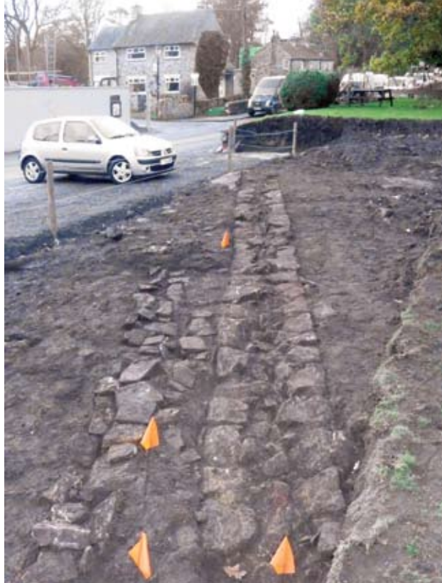
A large Roman building of 2nd- to 3rd-century date recently revealed during building works at Greta Bridge where Heart of Teesdale hope to undertake a community archaeology project

The Heart of Teesdale Landscape Partnership was launched in 2010 and is concerned with the landscape of Mid Teesdale, covering an area along the Tees Valley and River Greta from Eggleston to Winston, including Barningham, Bowes and Barnard Castle. This is an area sandwiched between the Yorkshire Dales National