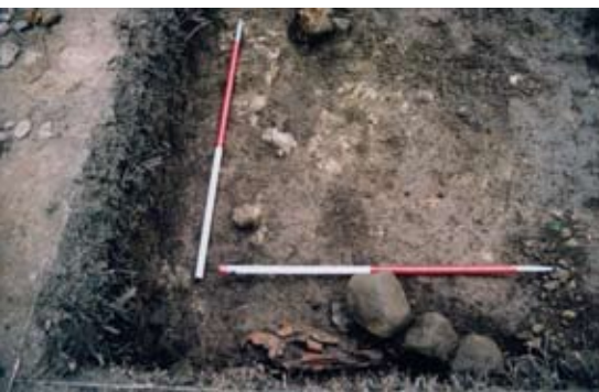
Horse head burial from the early 14th century