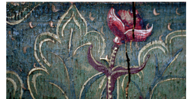
Painted panels in St Mary's Church