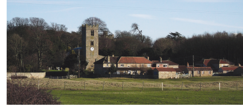
St Mary's Church, with the deserted medieval village in the foreground

The last unambiguous documentary reference to the village being occupied dates from 1382, some nine years before the castle was inherited by the Conyers. It is not