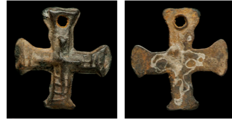
The front and back views of the pectoral cross found in the River Wear Actual size

which may have been manufactured locally, was cast in a single open-air clay mould. Although there is evidence of casting flaws, the object still maintains a recognizable form, therefore it would still have had a function. An object, possibly a flanged-head nail, was incorporated into the mould process to form the hole in the upper arm. The percentages of lead and tin in