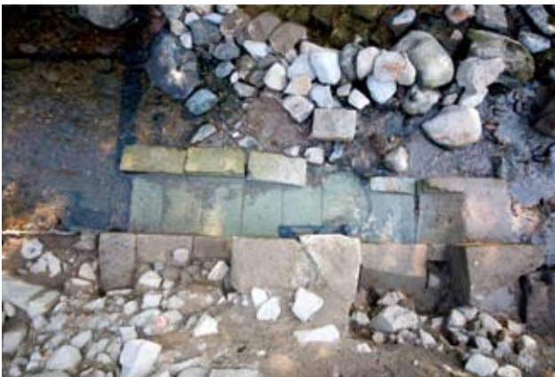
The wheel pit at the downstream site