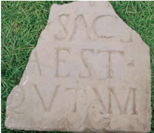
A fragmentary inscription, SACE ... A EST ... QVTVM, referring to a shrine ( sacellum ) dedicated by the commander of the cavalry garrison ( praefectus equitum )