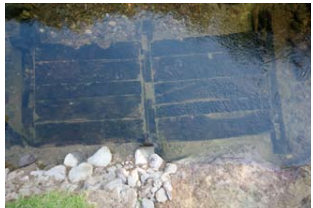
The timber structure in the riverbed at the upstream site

In the 13th century, the Newminster Abbey monks from Morpeth established themselves as large landowners in the Cheviots. Astute businessmen, the monks kept detailed records of their activities.