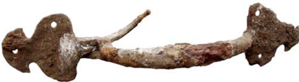
A 17th-century door handle Half size