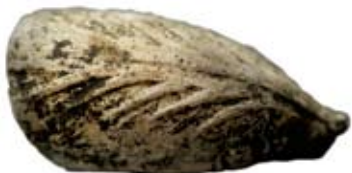
A clay pipe bowl from the 1820s Actual size