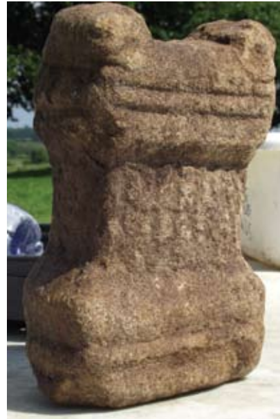
A portable altar, its inscription very eroded

The fact that this sub-Roman / early medieval activity was taking place not just within the fort but also in the extramural settlement to the southeast is extremely interesting, because its widespread nature suggests that Binchester continued to exist as a thriving community of sorts well into the 5th century. As well as a market for the surrounding area, Binchester may have continued as a centre of military power. As communities were forced to become more self-reliant as the wider administrative and social structures disintegrated in this period, one can envisage a scenario in which the residue of the fort garrison continued to provide protection