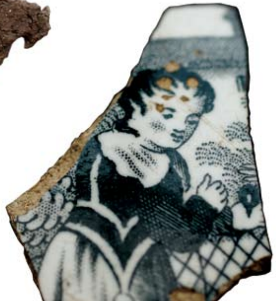
A fragment of Wedgewood porcelain c 1810