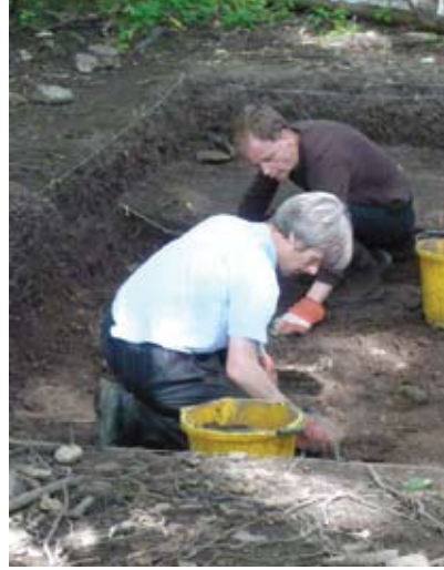
Digging in Trench 2 at Hornby

The building has yielded a significant volume of small finds, suggesting a late medieval elite usage. Pottery dating from the late 12th century (as a residual deposit) through into the early 16th century has been recovered, with a concentration in the late 14th and 15th centuries during the heyday of the Conyers ownership of the Castle. The pottery seems to be of two principal forms, utilitarian cooking vessels, originating primarily with the Winksley kilns near Ripon, and more exotic table wares associated with the Humber ware kilns, with a number of imports from South West France and eastern Spain. There has been a particular preponderance of wine jug handles, suggesting some form of elite entertainment