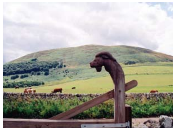
View of Yeavinger Bell from the site of Ad Gefrin