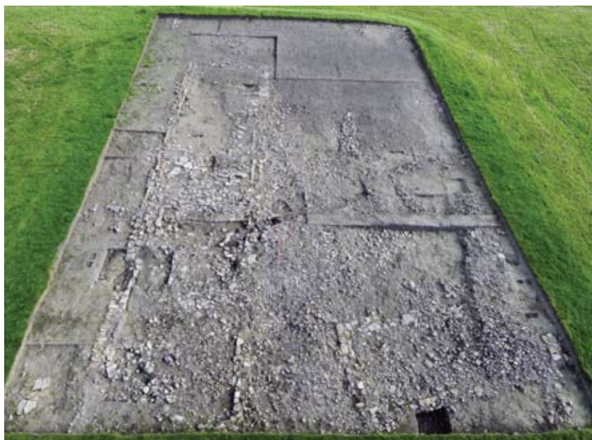
Aerial view of the site, showing a late Roman barrack block and a possible medieval building