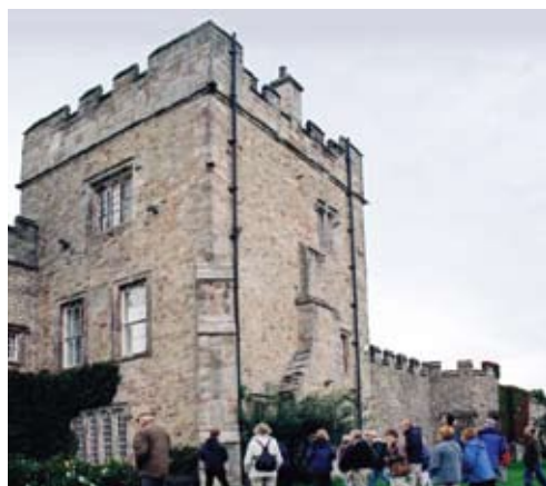
Visit to Hornby Castle with Erik Matthews, September 2009