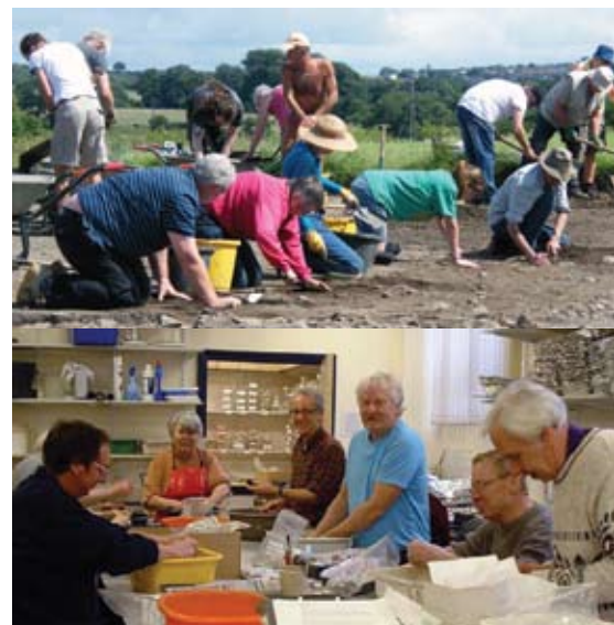
Society members working on site at Binchester (top) and helping with post-excavation work (above)