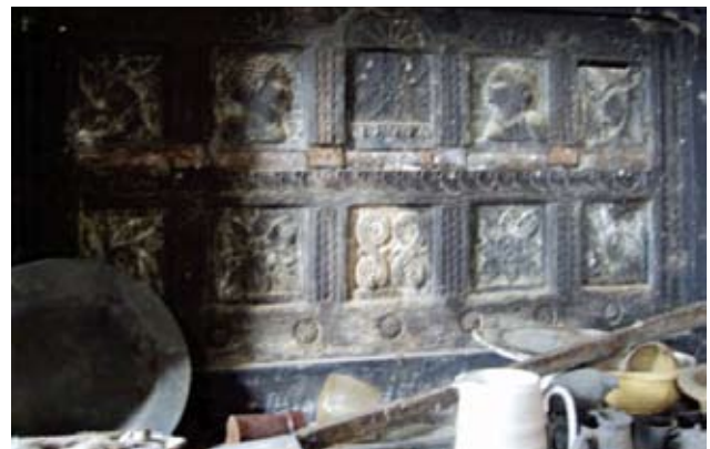
Medieval panelling in the dining room at Sockburn Hall

We have a full and evolving package of fieldwork activities to cover a range of tastes this year. We start on 27 February with the first of what will hopefully be a number of sessions at Sockburn Hall near Darlington, recording the re-used medieval panelling in the dining room.